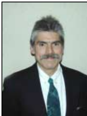
Harbor Country® Lodging Association