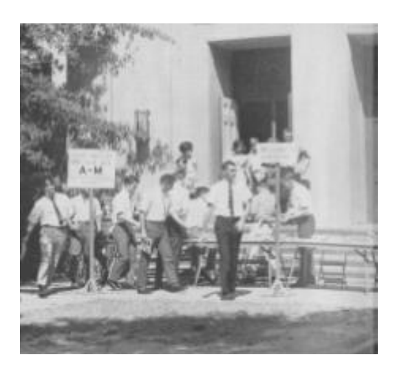
sc.edu/advising © 2024 University of South Carolina