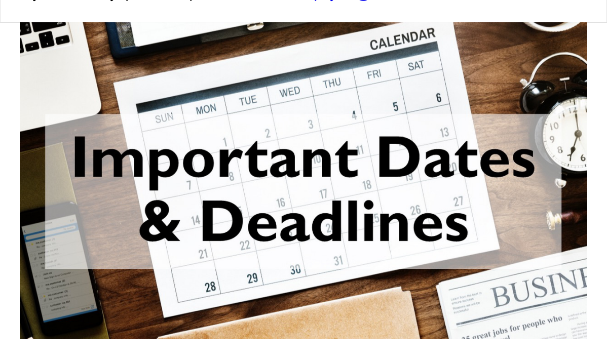
July 5 by 12pm: Deadline for Payroll Retro Submissions for pay period ending 06/30/23

If you have any questions, please reach out to payroll@mailbox.sc.edu.