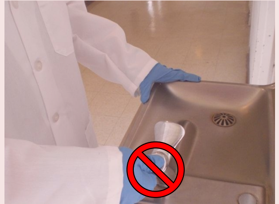
NO touching common surfaces (drinking fountain)