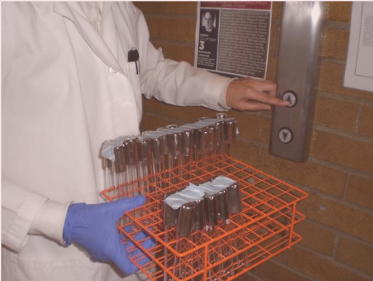
Transport of hazardous materials outside the laboratory