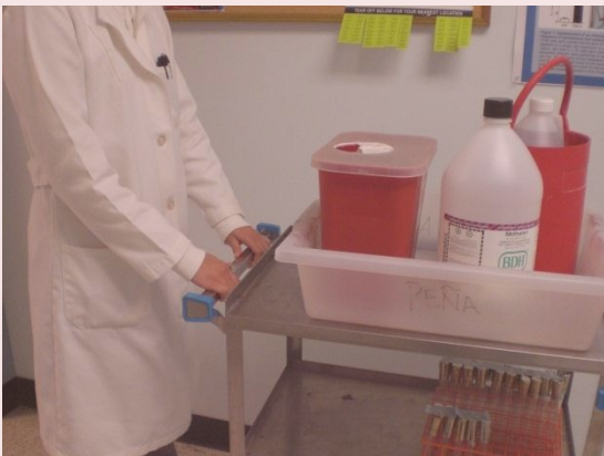
Transport of hazardous materials outside the laboratory (hazardous materials in secondary containers on a cart)