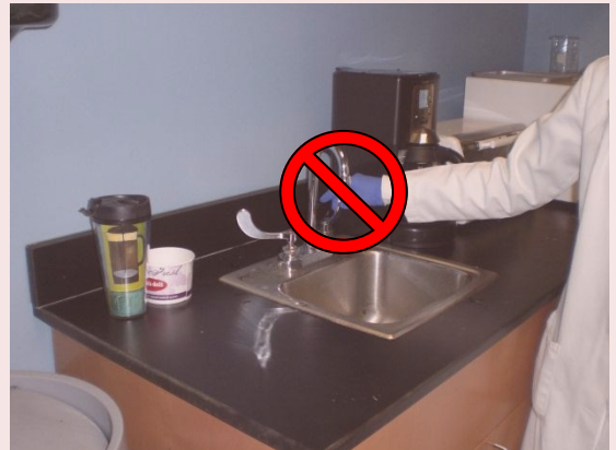
NO GLOVES and other PPE in common areas like break rooms, restrooms, offices and others