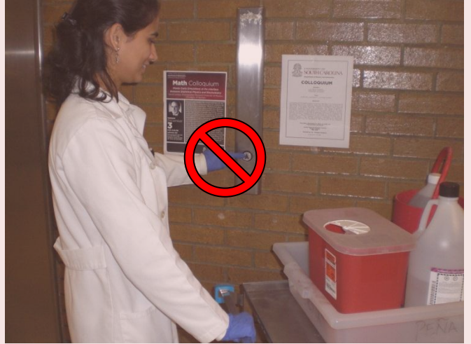
NO touching common surfaces (elevator button)

Gloves must NEVER touch common surfaces outside the laboratory. Gloves worn in common areas spread contamination from hazardous materials handled in the laboratory.