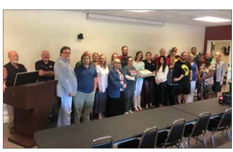
USC Union Celebration May 1, 2018