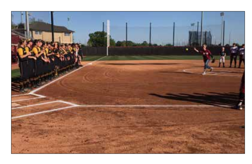
Chancellor Elkins throws out first pitch at USC Softball April 20, 2018