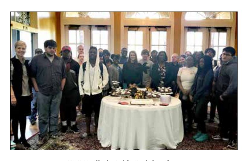
USC Salkehatchie Celebration April 2, 2018