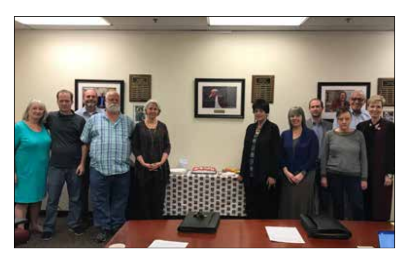
USC Extended University Celebration April 6, 2018