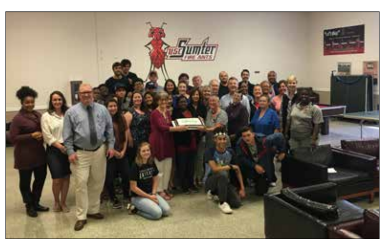
USC Sumter Celebration April 24, 2018