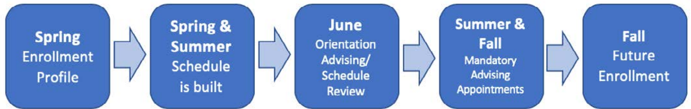
Figure 1 Advising contacts for incoming first-year students at Northern Arizona University

during the academic year to address enrollment, course selection, academic progression, and developmental questions (see Figure 1). As enrollment at NAU reached 6,614 first-year and exploratory students in Fall 2018, it became a challenge to meet with everyone who needed advisement. To help students persist into their sophomore year, GSSC staff sought innovative and creative new strategies to support student learning, development, and success. The search led to the creation of enrollment tutorial videos available in Blackboard Learn, NAU's learning management system.