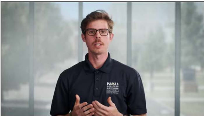
Screenshot from Northern Arizona University's Gateway Advising YouTube channel, where incoming students can learn more about advising tools.