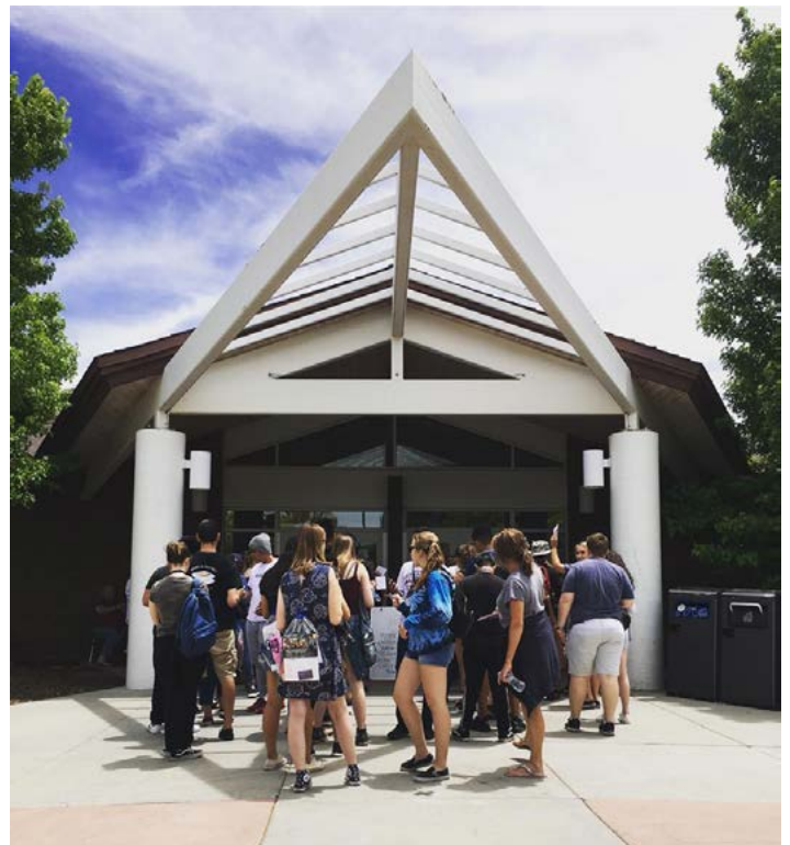
Incoming students attend orientation at Northern Arizona University's Gateway Student Success Center.

Social media data indicated GSSC's followers saw and engaged with the posts; the Facebook data also showed an increase of followers from about 300 to nearly 600 during the 2018-2019 academic year. GSSC staff used Facebook analytics to identify the best times to post (9 a.m. and