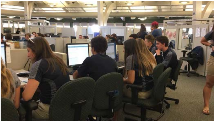
Northern Arizona University academic advisors assist incoming students with tasks like registering for courses.