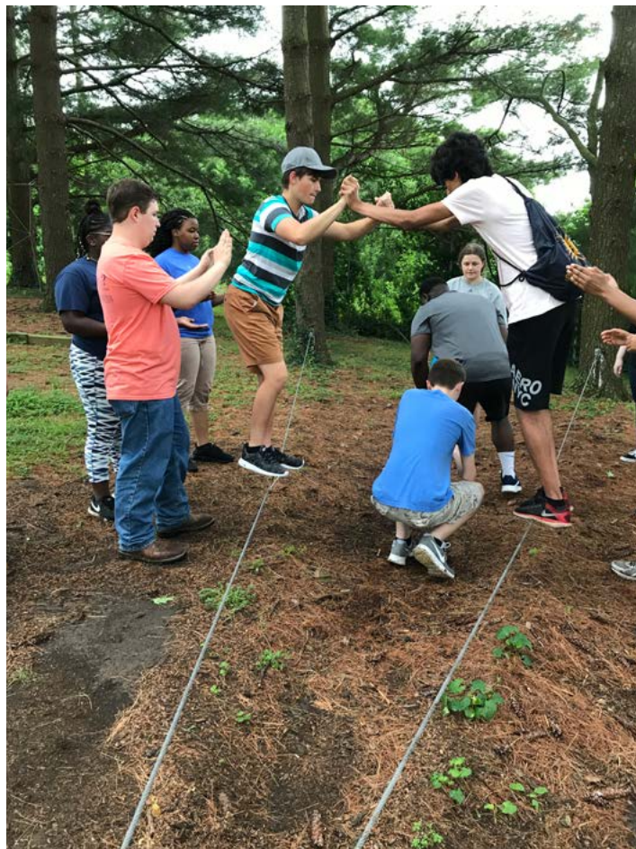
Berea Bridge seeks to connect participants with academic and community support and also build relationships through team exercises like this ropes course.