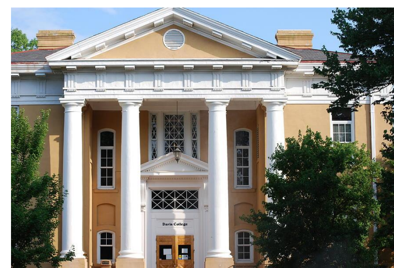
Davis College is the home to Information Science at the University of South Carolina.