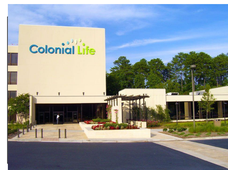
Colonial Life building here in Columbia, SC. Colonial Life has been a part of the Columbia community since 1937.

After becoming enthralled in Information Science, it became clear that it was my passion, and that a career in a similar field would fit my skillset and desires. When it was time to look for an internship for the summer of 2018, I utilized Handshake, a service provided here at the University of South Carolina. It was in Handshake that I found the Colonial Life Scholars Program. After a phone interview, I was called in to interview for a second time. During my second interview, I was questioned by what would end up being my boss and co-worker. The interview went incredibly well, and the next day I was contacted with a job offer. This began my stint with Colonial Life.