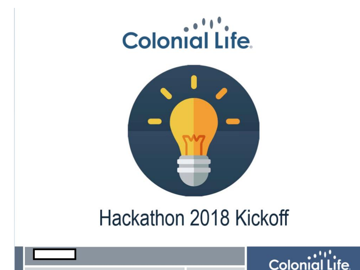
One of the first events I was a part of was a Hackathon. We ran this event as a way to provide a creative opportunity to work on an idea of your own that would help the business.