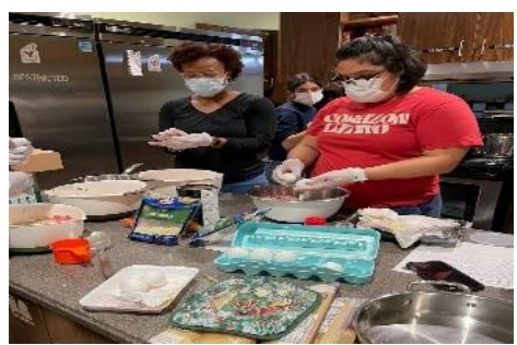
November 2022 Community Service Ronald McDonald House Charity

September 2022 (Virtual) For What and For Whom? Creating Professional Priorities