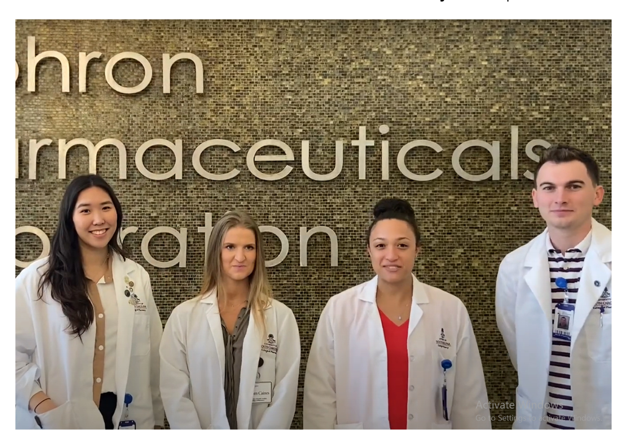
"Challenge Accepted" | A student research team from the UofSC College of Pharmacy won first place in a recent SCBIO Student Video competition. Read more