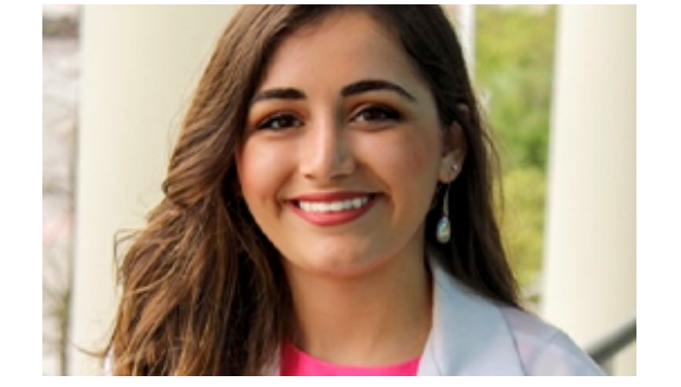
Meet the Next KPIC Community Pharmacy Residents

The Kennedy Pharmacy Innovation Center at UofSC partners with a variety of practice sites to offer postgraduate residency training positions.