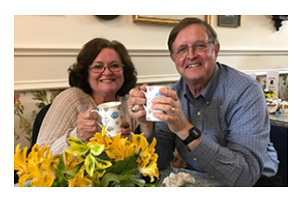
Gardening - It is Good for the Body and the Soul