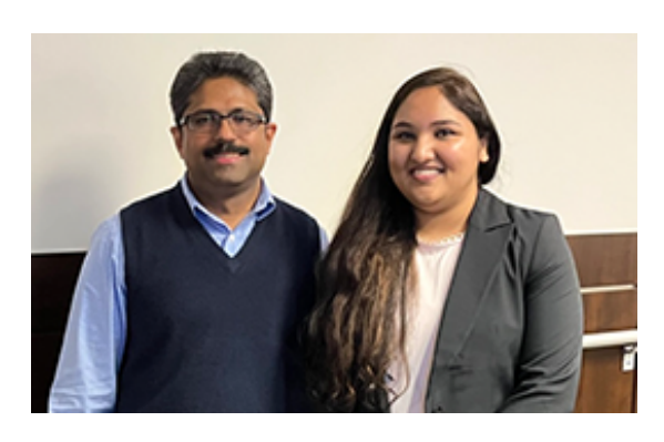
UofSC Researchers Resolve Mystery of Resveratrol