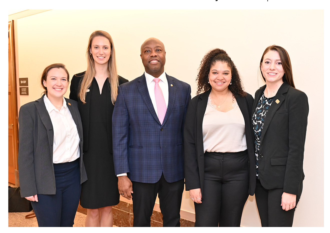
Future pharmacy leaders build their national network | Pharmacy alumni and students traveled to Washington, D.C. for 'Policy, Advocacy and Leadership Immersion Week,' part of the Walker Leadership Scholars program. Read more...