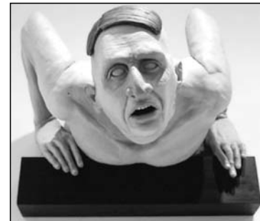
Works by Curt LaCross are on view at McMaster Gallery this month.