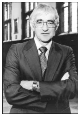
John Dominic Crossan

"historical Jesus," or the real facts about the person to whom various Christian gospels refer.