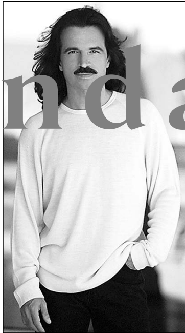
Yanni comes to the Colonial Center March 30.