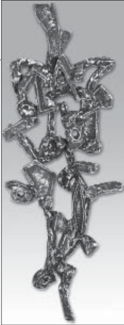
Block Angel, by Roy Strassberg