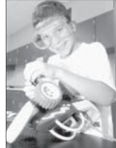
Camp Invention challenges children to be creative.